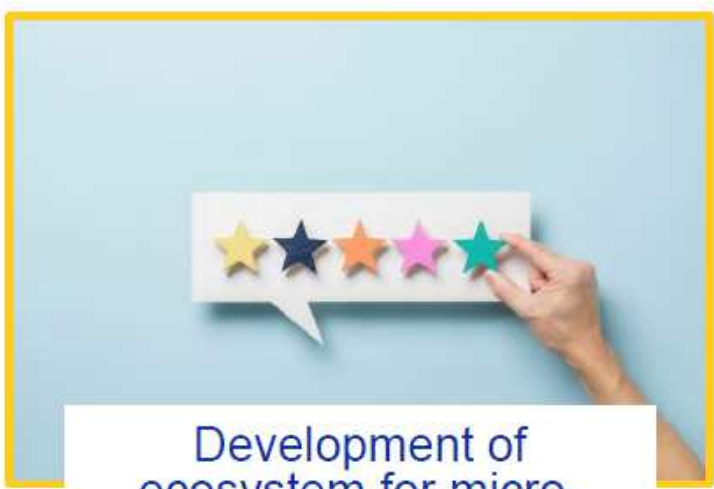
Development of ecosystem for micro-credentials